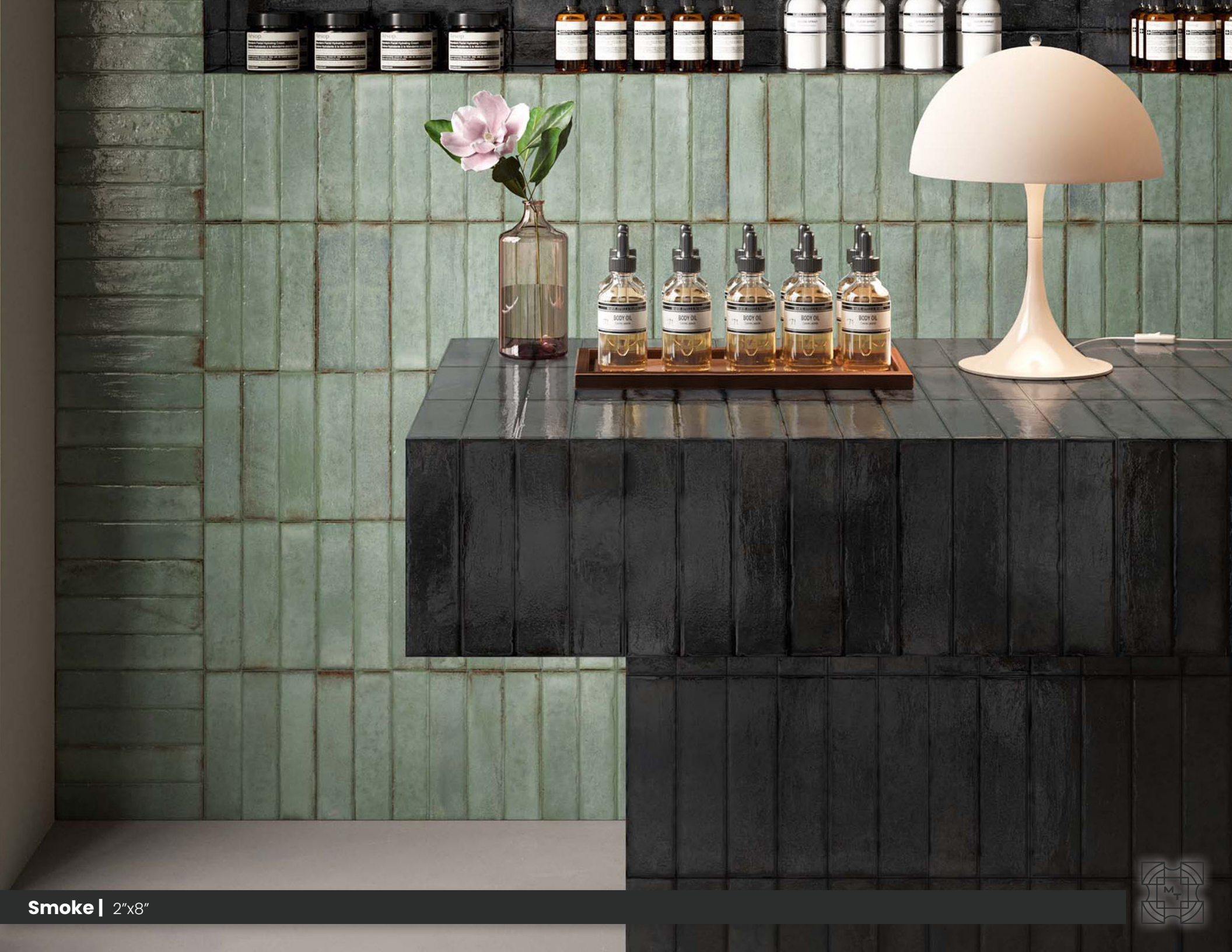
Smoke | 2"x8"