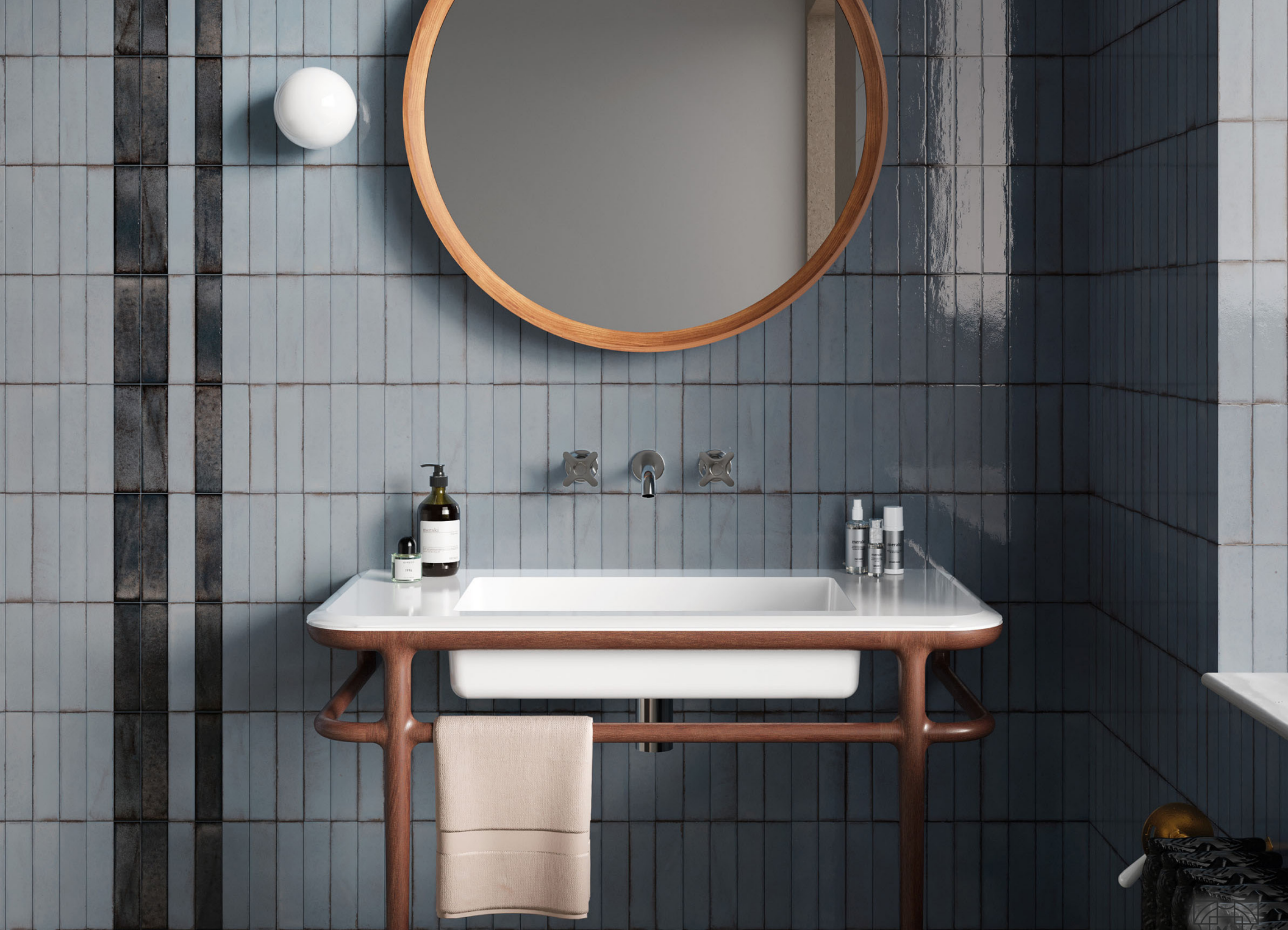
Artic | 2"x8"