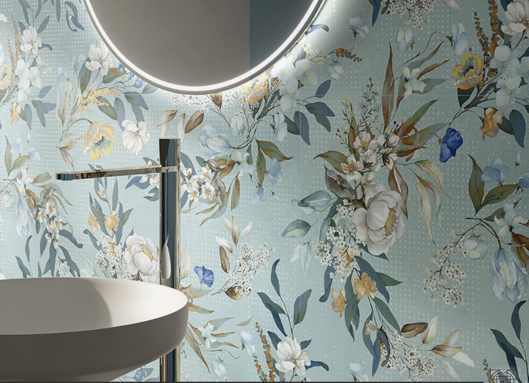
Jardin 08 | 24"x48"