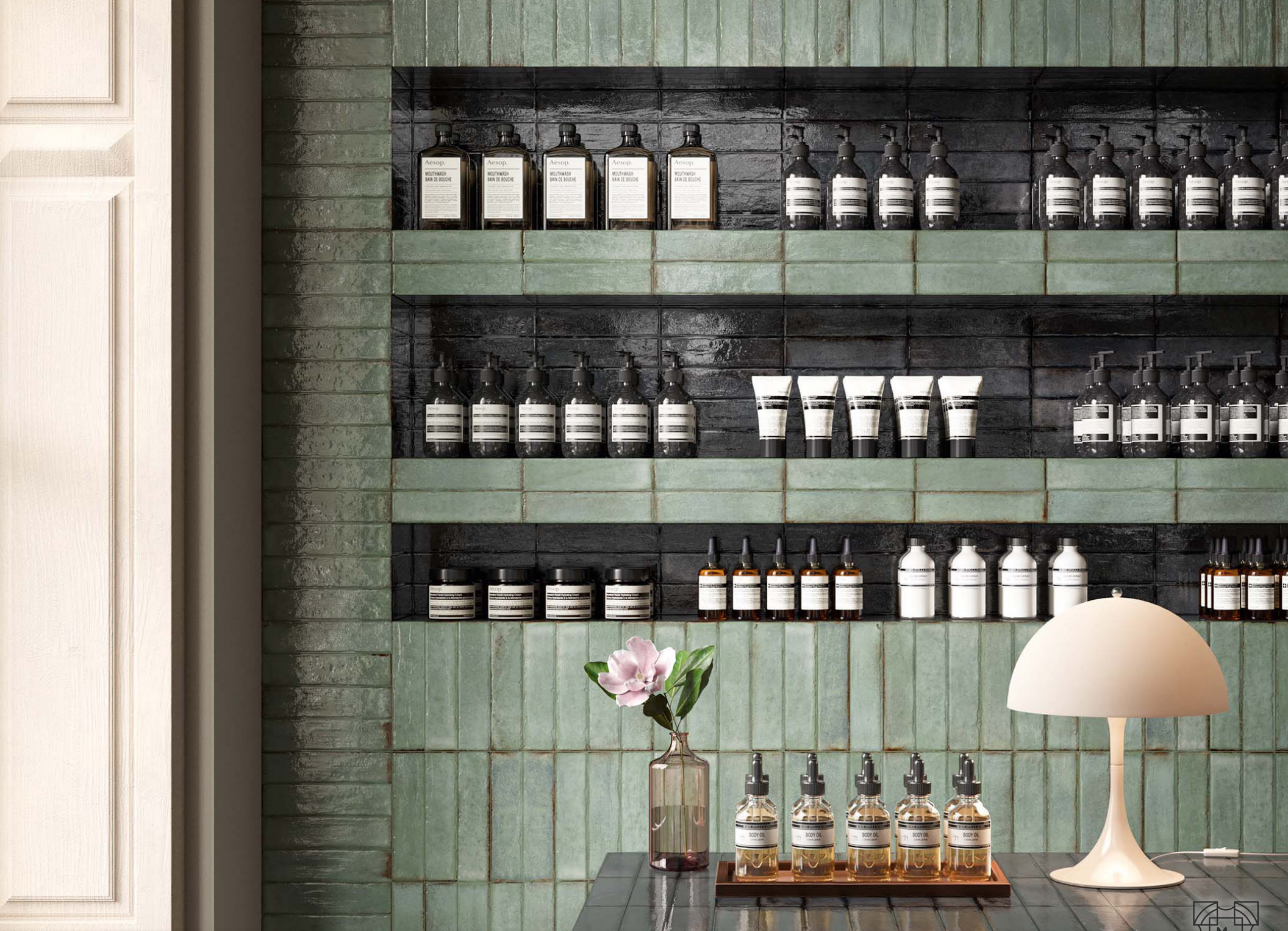
Sage | 2"x8"