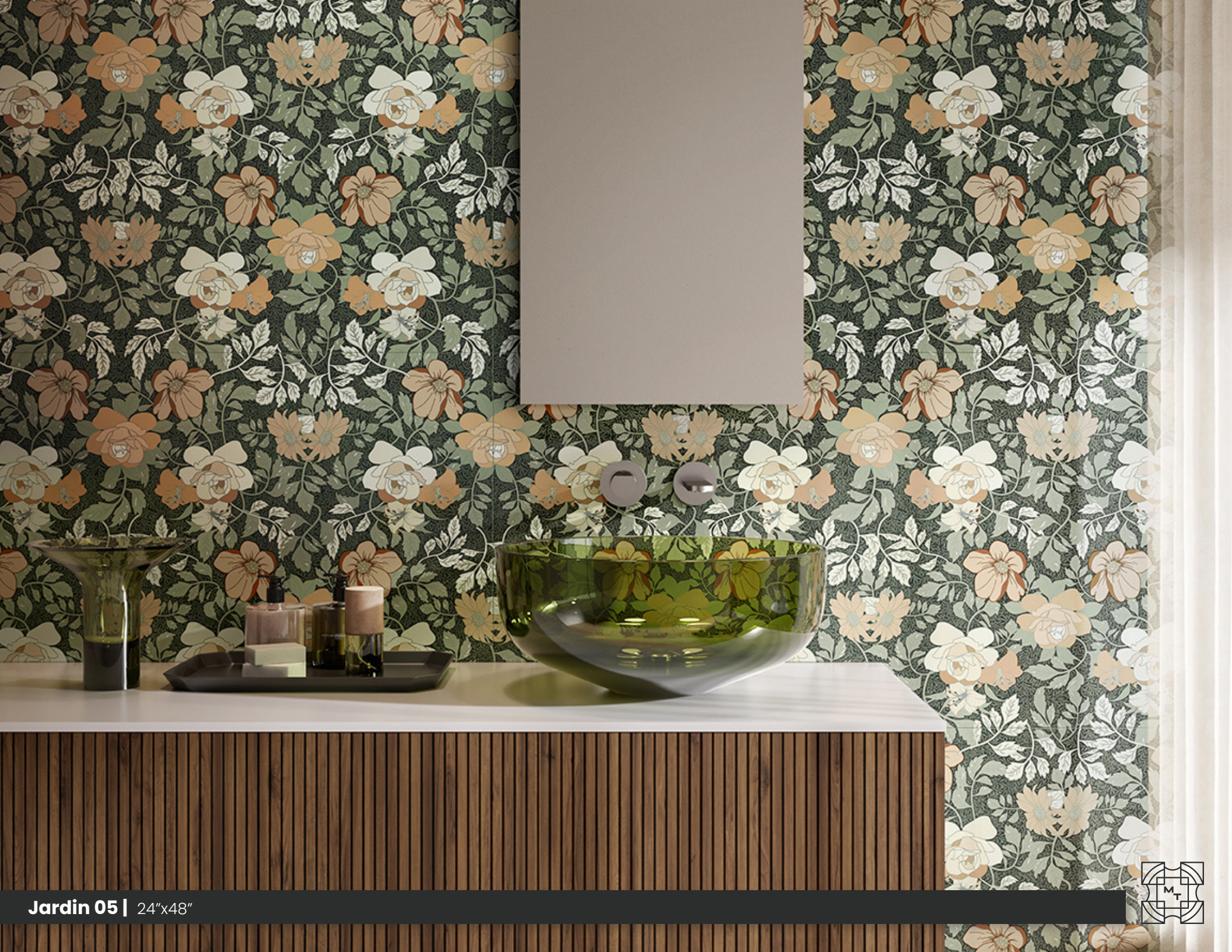
Jardin 05 | 24"x48"