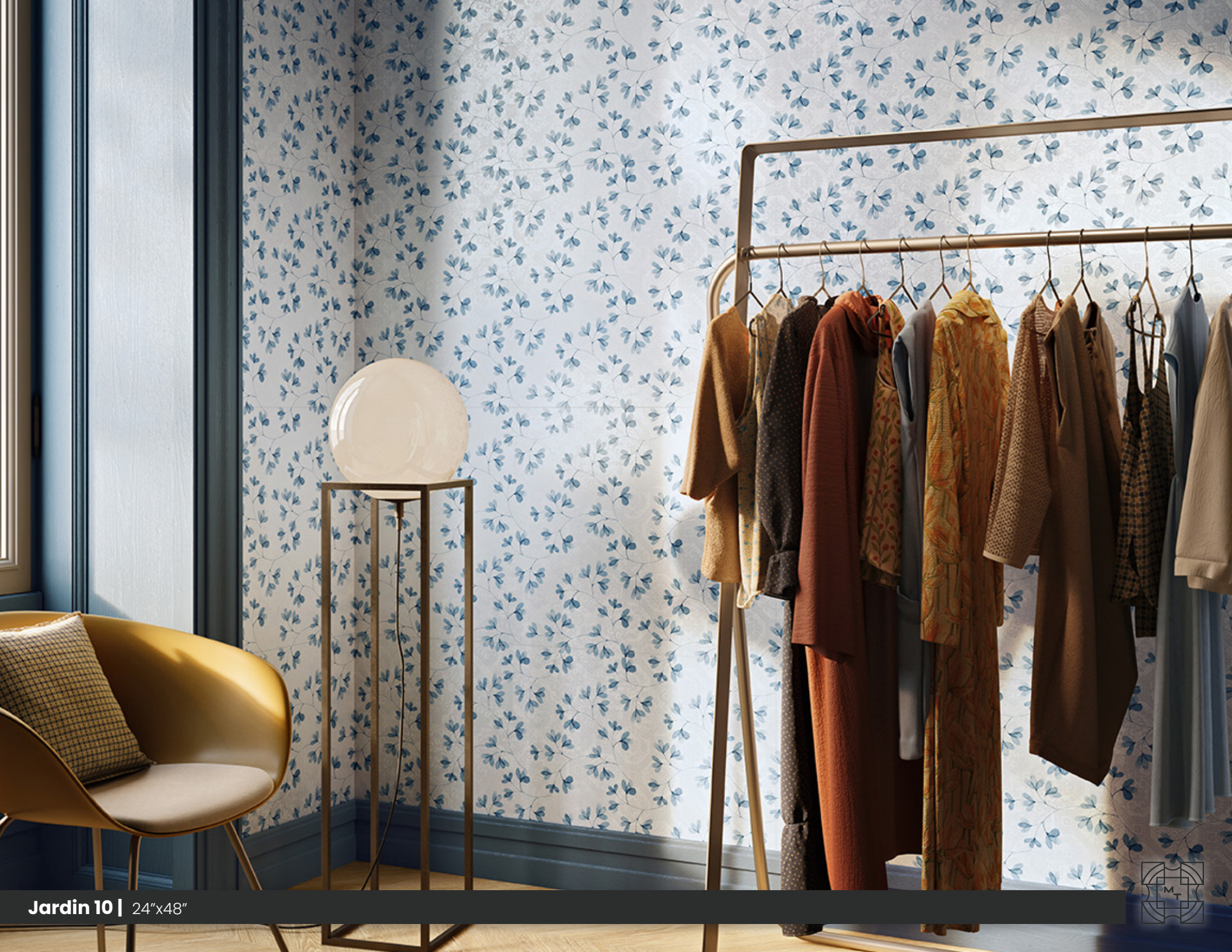
Jardin 10 | 24"x48"