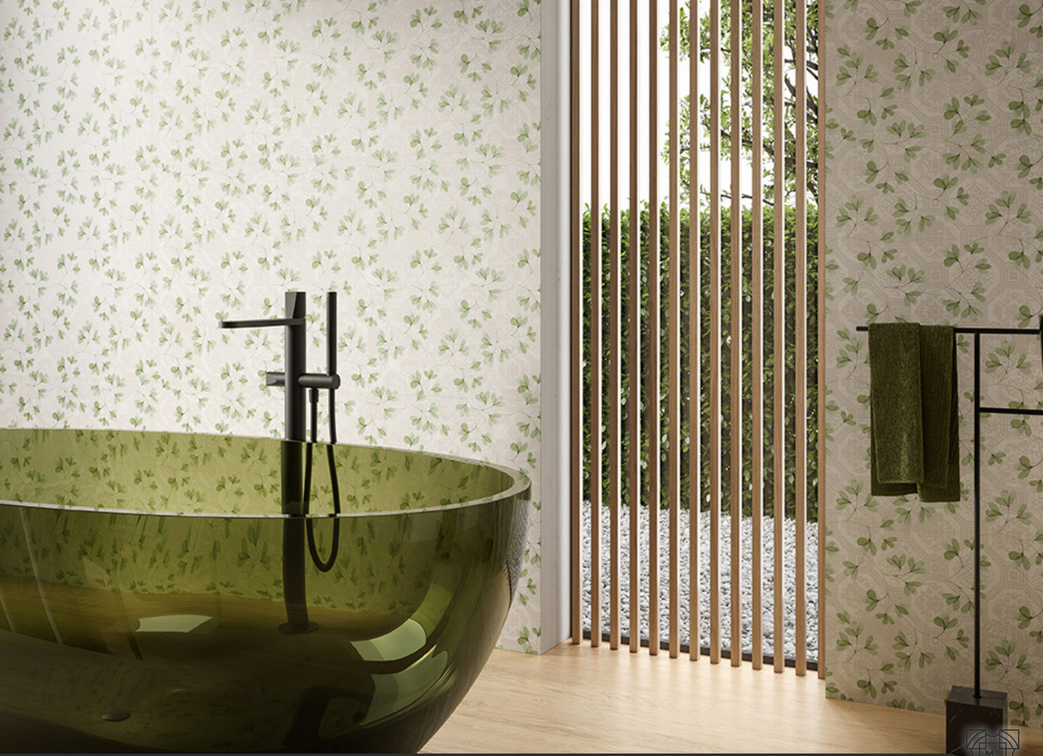
Jardin 09 | 24"x48"