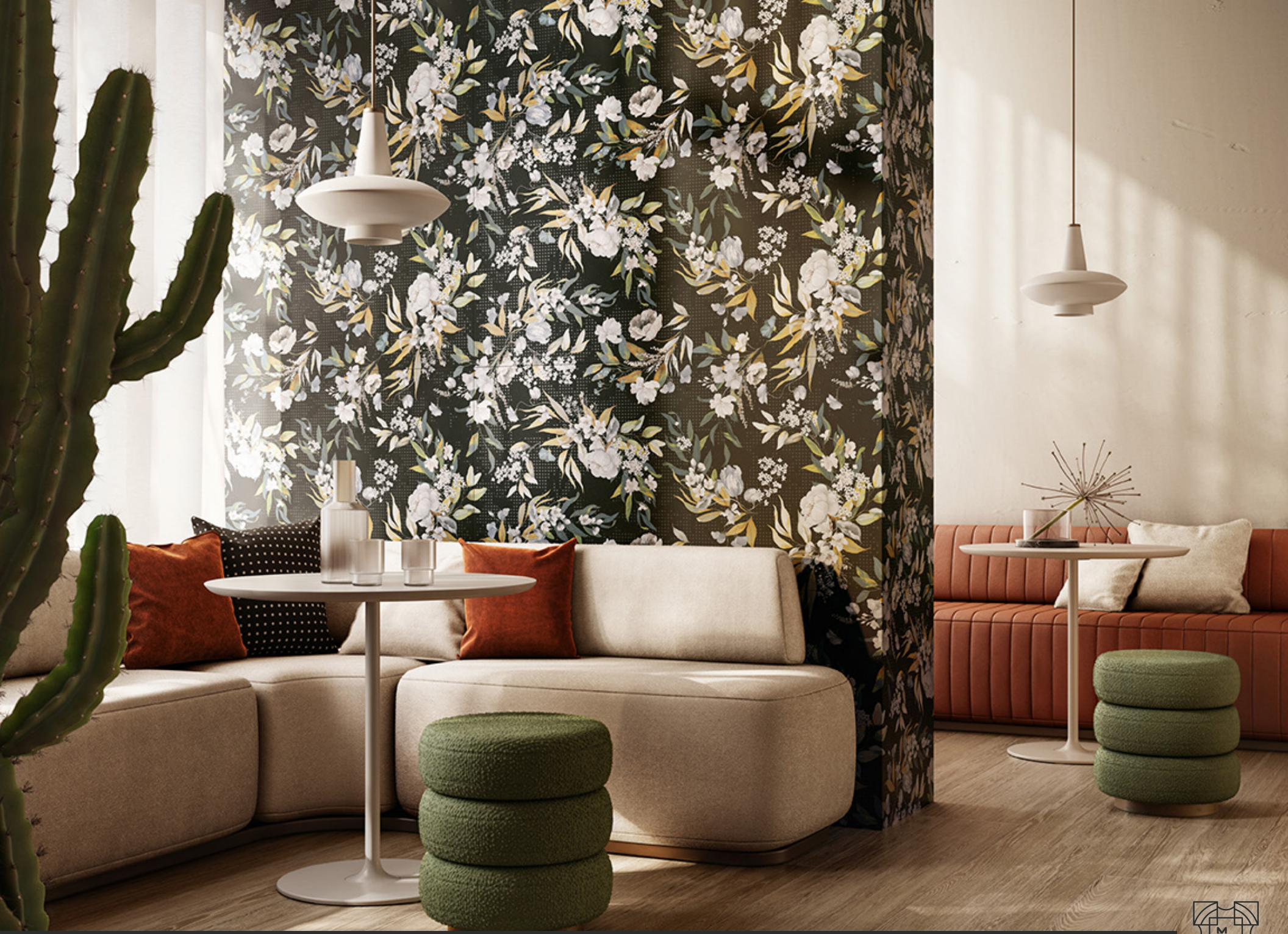
Jardin 07 | 24"x48"